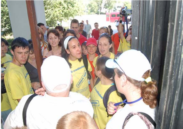
Religious protesters trying to gain entry into the cine club, Causeni

4.3.1.5 After lunch the event continued with the showing of a film at the local cinema club. As participants walked to the club a Volga car with official government number plates (RM A 177) drove by. Leaflets with the words "Will Causeni become Sodom?" were thrown from its windows.